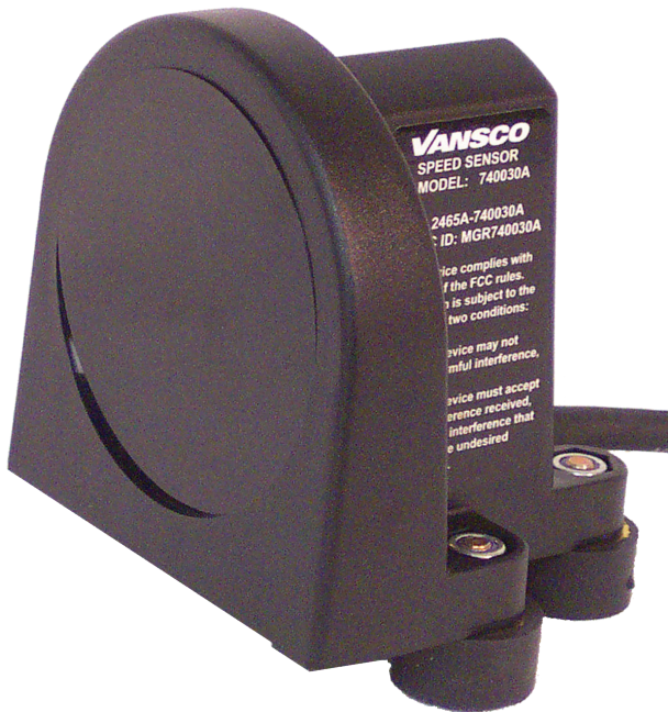
VANSCO TRUE GROUND SPEED SENSOR (MODEL #740)

Accurate speed sensing is one of the keys to achieving top performance from your electronic monitoring and controlling equipment. An incorrect speed signal can create significant errors in speed and distance measurement, chemical and fertilizer application and yield calculations resulting in costly mis-applications, crop damage, reduced yields, and inaccurate information for your overall management program.